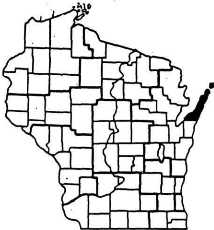
WISCONSIN (with Door County highlighted)